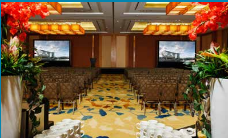
Green Meetings Set-up

We will consolidate your event's environmental impact data and highlights of your achievements for the ease of your communication to your stakeholders.