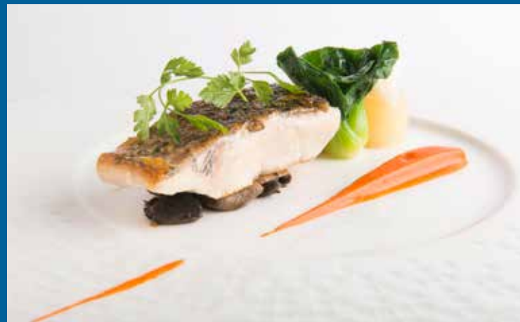
Pan-Seared Seabass from the Harvest Menu

Would you like to educate your attendees or VIP guests about the green initiatives of the event venue you chose? We provide Sands ECO360 tours to showcase the sustainability efforts at our resort!