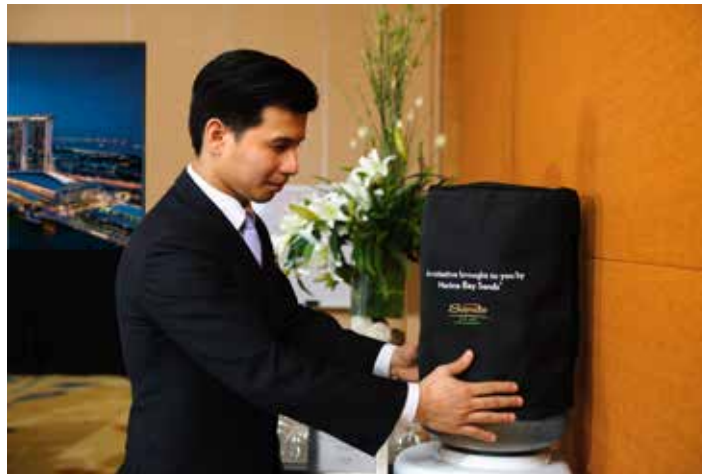
Green Meetings Concierge

They will be your dedicated guide and assist you throughout the entire event planning process!