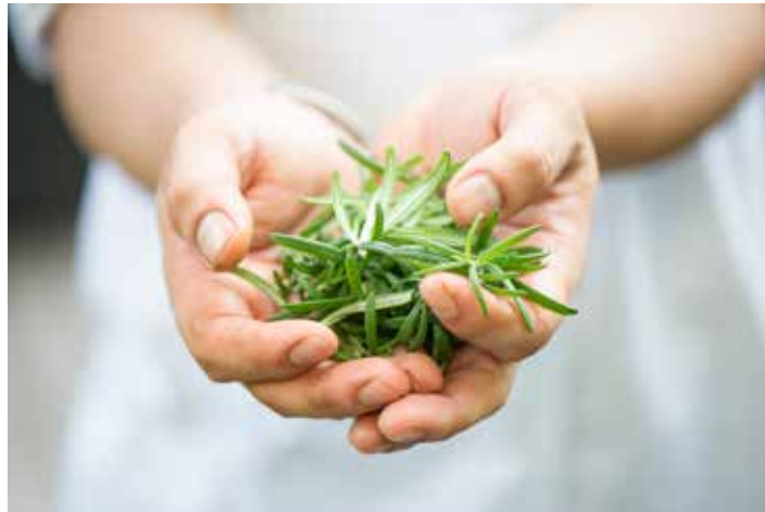
RISE Herb Garden

In addition to our standard green meeting practices, we provide sustainable options to our meeting planners and clients; offering many ways to further reduce the environmental impact of your event. Talk to your Green Meeting concierge to customize your green meeting options.